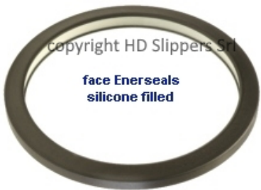
Spring Energized Seals face sealing with silicone filling