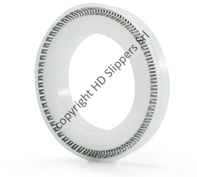
Spring Energized Seals in PTFE PU UHMWPE