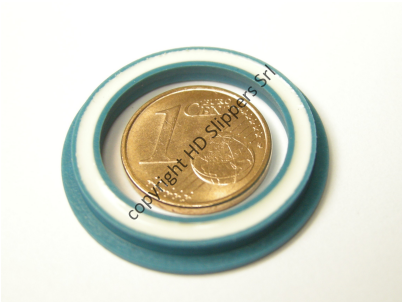
Spring Energized Seals