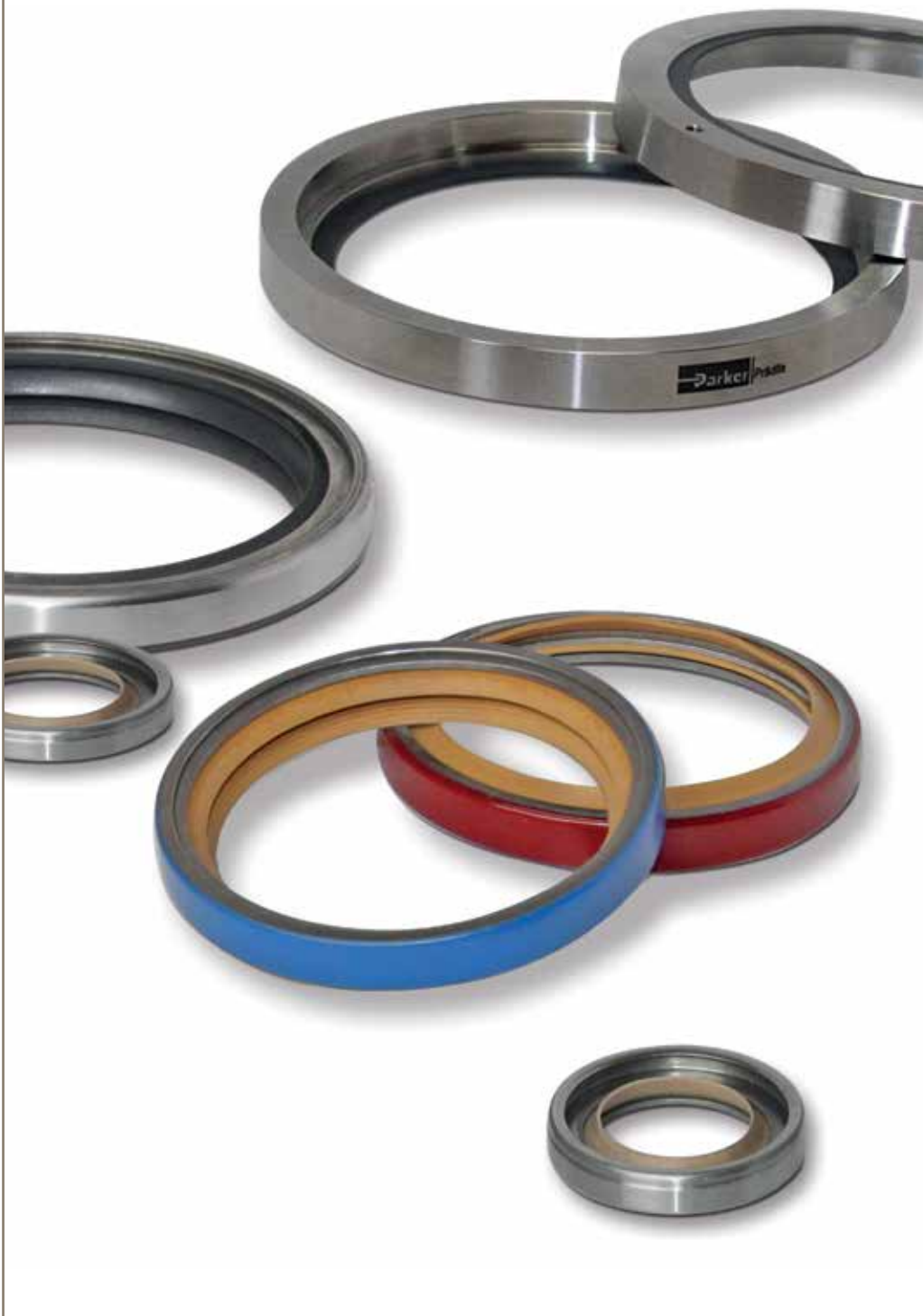
FlexiCase® Rotary Seals

aerospace climate control electromechanical filtration fluid & gas handling hydraulics pneumatics process control sealing & shielding